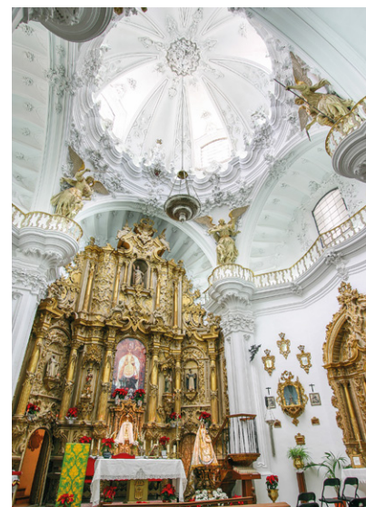
Las Mercedes–interior view

The Chapel of Belén is an example of popular religious architecture: it has a doorway from the 17 th century, and was rebuilt in the 18 th century. Inside can be seen a niche with the Virgin and Child with Saint Joseph, and there are a number of interesting paintings dating from the 17 th and 18 th centuries.