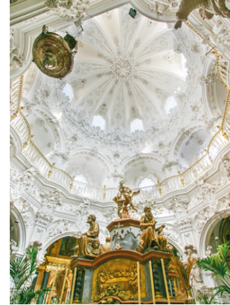
Sacristy of La Asunción