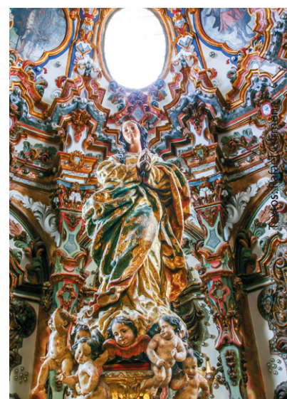
Chapel of the Virgin, San Pedro