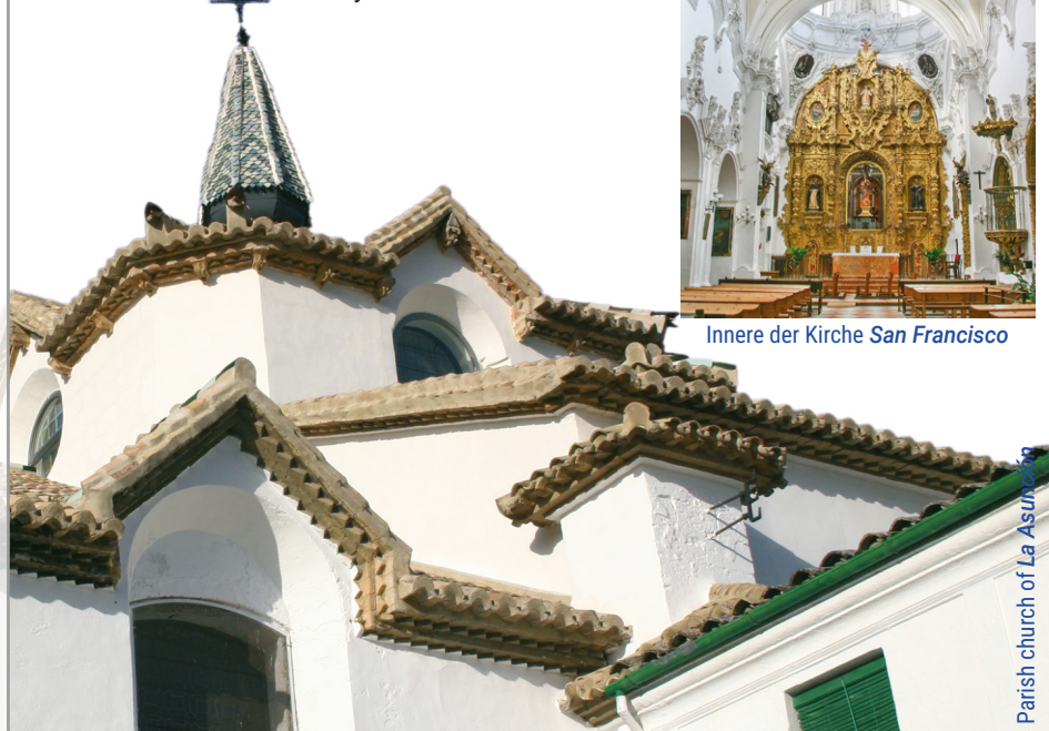
Parish church of La Asunción