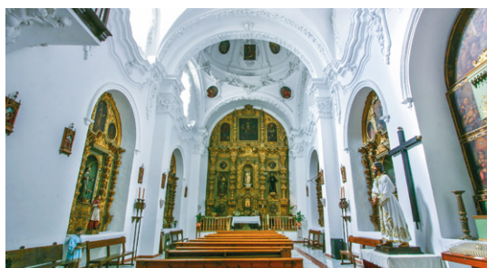
San Juan de Dios–interior view