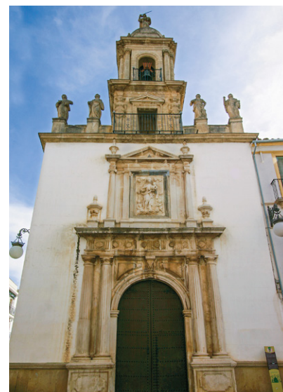
Church of El Carmen–facade