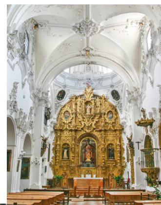
Innere der Kirche San Francisco