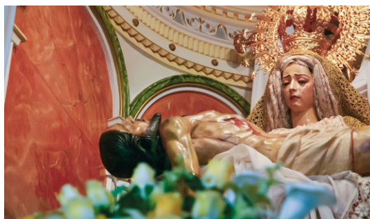
Our Lady of Las Angustias