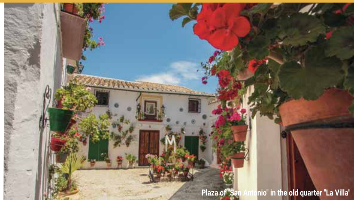
Plaza of "San Antonio" in the old quarter "La Villa"