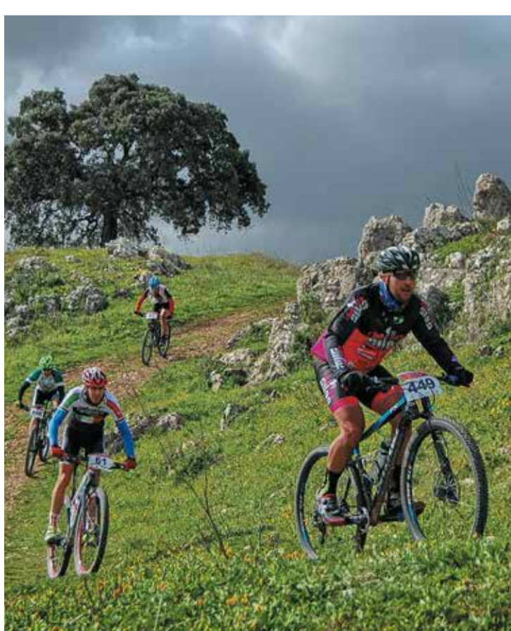
Bicycle routes in the Natural Park

The Sierra Horconera is particularly interesting. Towering above it are the peaks of Bermejo, 1,476 metres high; and the highest mountain in Córdoba province, La Tiñosa , 1,570 metres, which combine to form an impressive limestone massif.