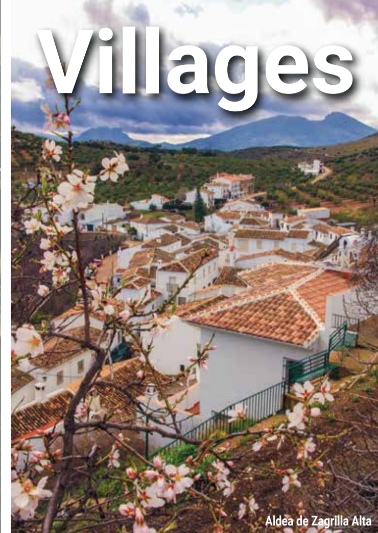
Aldea de Zagrilla Alta

In these small villages, you will find the attraction to the popular things, the labour which keep our traditions and cultural heritage alive. The essence of rural life.