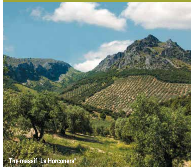
The massif "La Horconera"

A palette of colour. Earth and open skies. Sunshine and running water. Valleys and mountains, limestone-carved hills, chasms and caves. This is the land of the Natural Park and Geopark of "Sierras Subbéticas" in the heart of Andalusia.