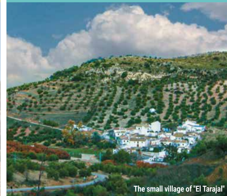
The small village of "El Tarajal"

In these small villages, you will find the attraction to the popular things, the labour which keep our traditions and cultural heritage alive. The essence of rural life.