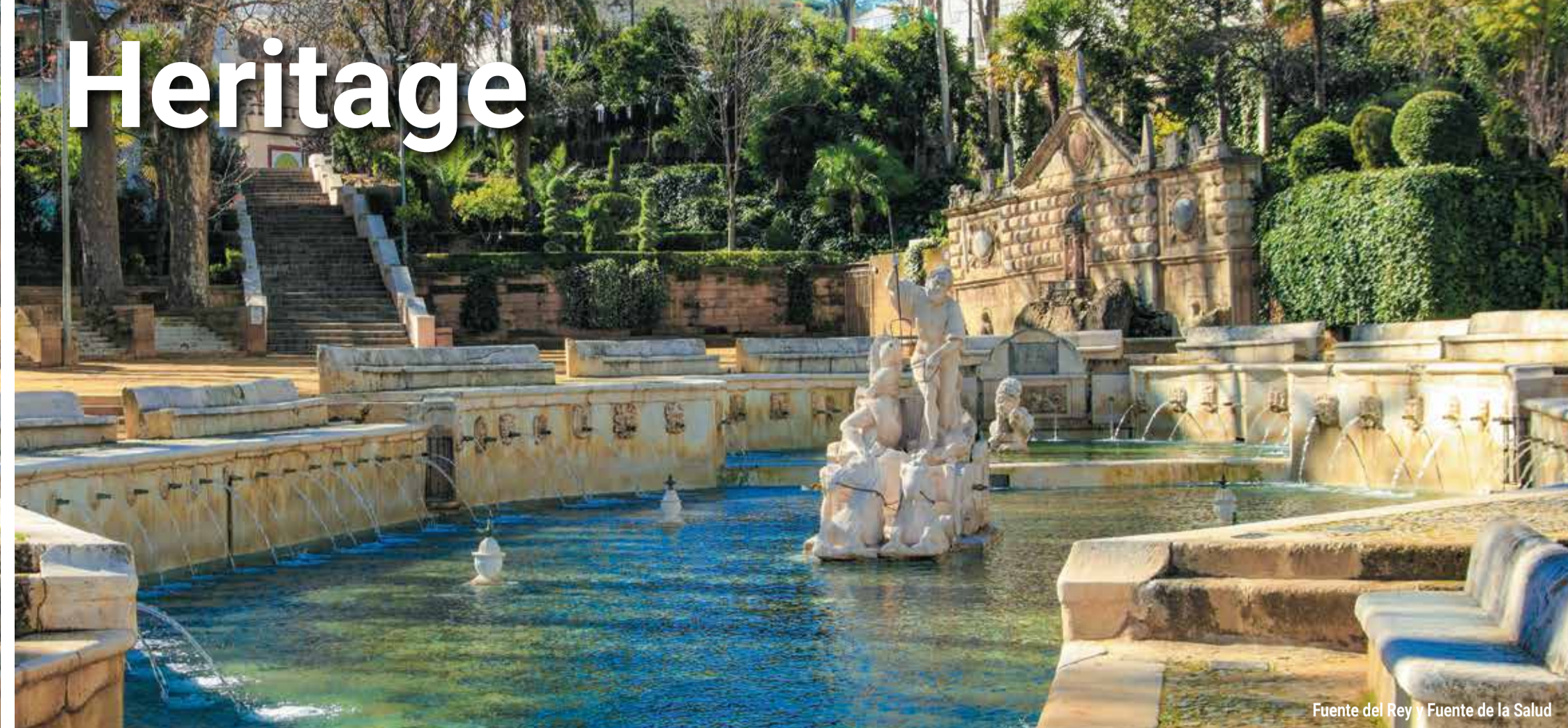
Fuente del Rey / Fuente de la Salud

Welcome to our town. We invite you to delight all your senses with a gentle stroll through the heart of our rich and varied history, to contemplate our numerous monuments, recognised as national interest. Let yourself be carried away by baroque art at its finest, wander alongside the ancient castle walls, through the narrow winding alleyways of the old Moorish quarter, the "Barrio de la Villa". Feel the unquenchable murmur of its fountains, the scent of its streets, the light of its whitewashed houses... and so much more.