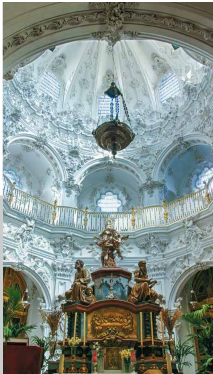
The Sacristy of La Asunción

The Church of "San Juan de Dios": with a single nave divided by pillars. Its rounded dome with radial arches is a forerunner of the vaulted style. It was built by Francisco Hurtado Izquierdo.