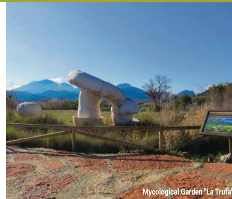
Mycological Garden "La Trufa"