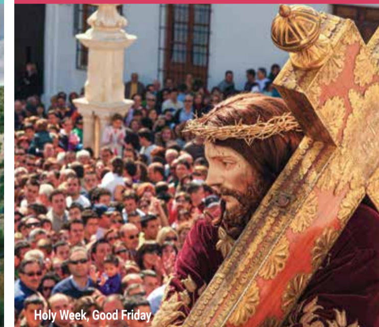
Holy Week, Good Friday

The expression of a way life, of feeling, of being. This is a town steeped in custom and tradition, a rich culture to be enjoyed and shared.